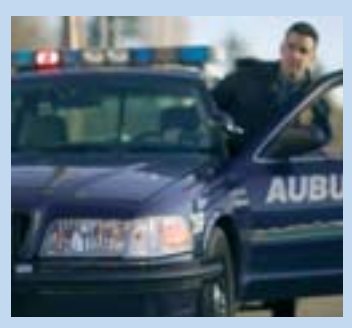
Coming to the rescue Often first on the scene of an emergency, police forces equipped with AEDs can cut defibrillator response time to SCA victims by three minutes.<sup>4</sup>

SCA can happen to anyone, anytime, anywhere and sometimes in extreme conditions. Rely on the Philips HeartStart FRx Defibrillator to be up to the task. In the hands of those who get there first, it provides the power to save a life.