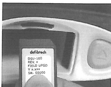
Figure 2: Insert the DSU-100 Software Upgrade Data Card as shown.